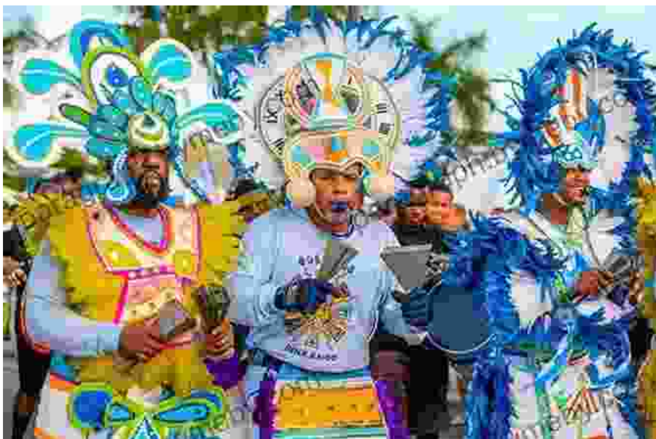
A vibrant festival procession filled with traditional costumes and music.

Beyond its architectural wonders and artistic treasures, Guanajuato is defined by its vibrant cultural traditions. Labourdette's photographs provide a glimpse into the heart and soul of the region, capturing the essence of its festivals, music, dance, and cuisine.