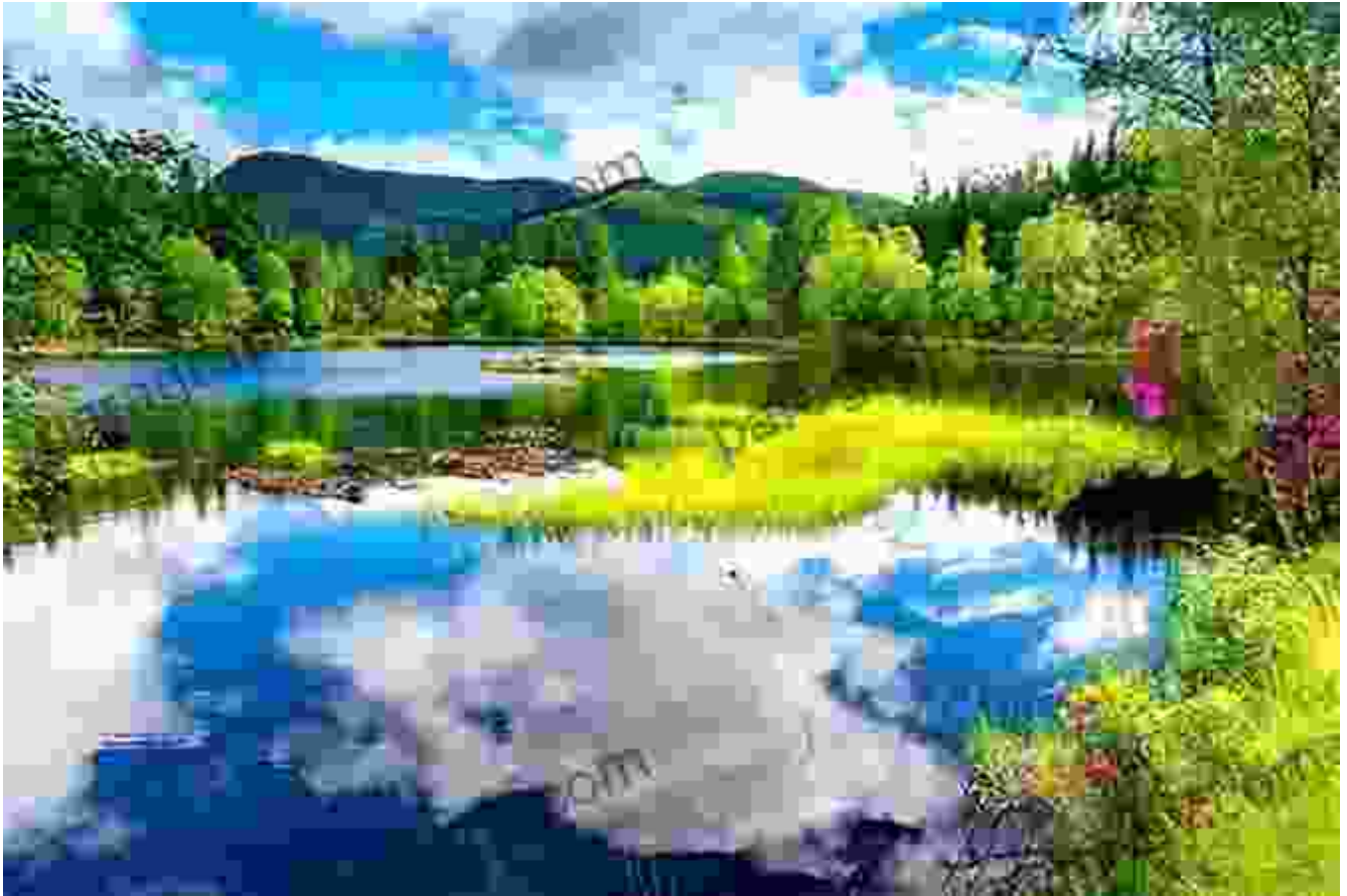
Image 1: A tranquil lakeside scene invites you to escape into nature's embrace.