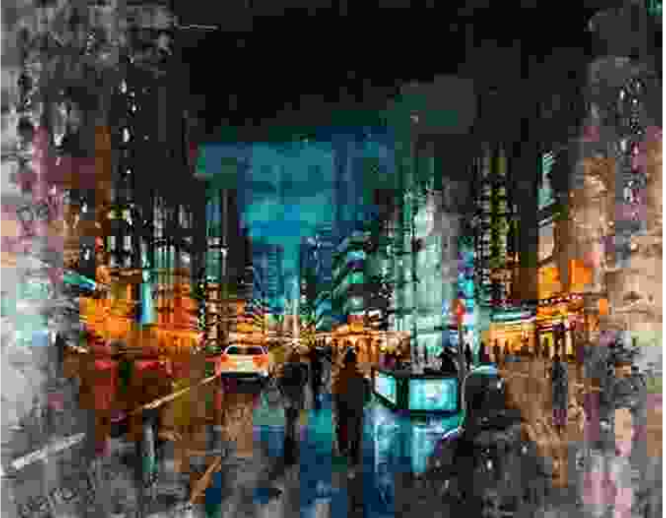
Image 4: A breathtaking cityscape showcases Kumo's ability to capture the essence of urban life.