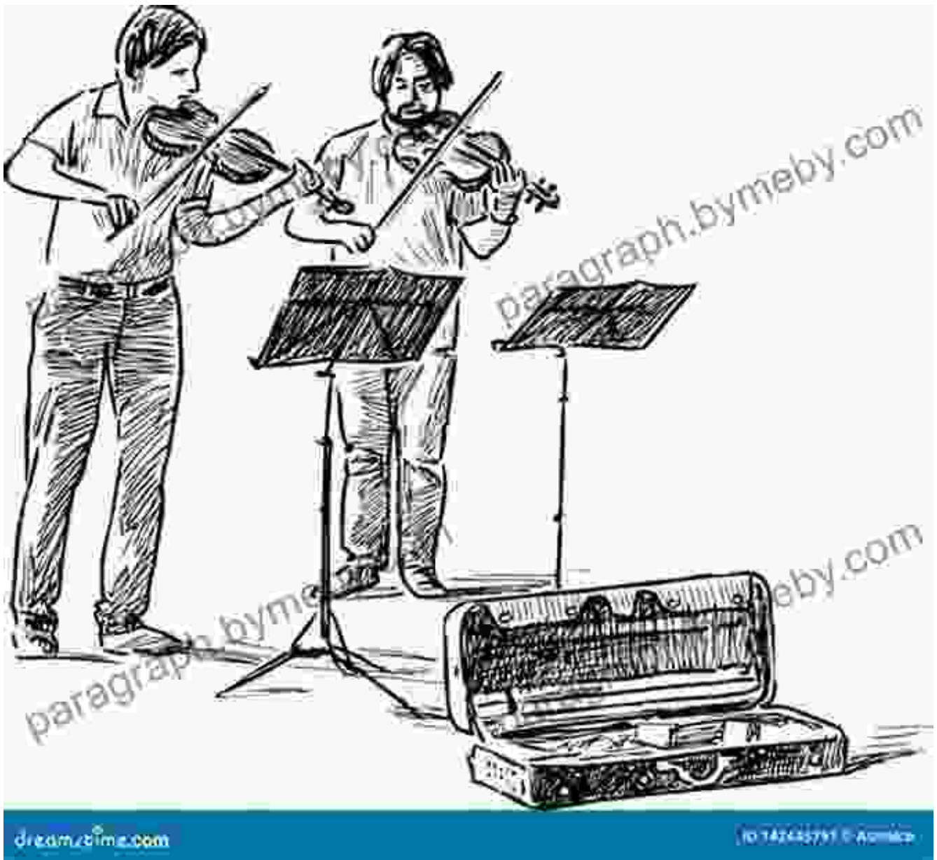
Image 2: A vibrant street scene captures the energy and movement of a musical performance.