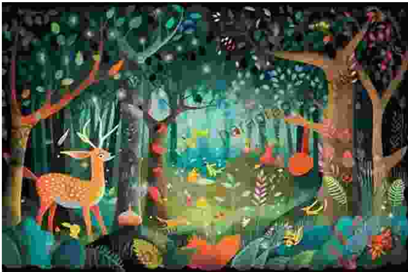
Image 3: A whimsical creature bursts with colors and imagination, showcasing Kumo's unique style.

Whether you're a seasoned artist or just beginning your creative journey, this book will ignite your imagination and encourage you to explore the boundless possibilities of art.